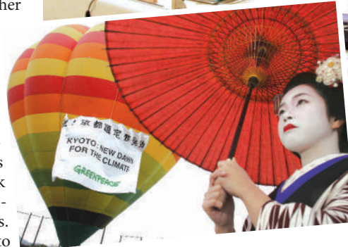
The treaty negotiated at Kyoto in 1997 has been ratified by 172 nations. Has it made a difference?

steps. However, these approaches begin to recognize the reality that fewer than 20 countries are responsible for about 80% of the world's emissions. In the early stages of emissions mitigation policy, the other 150 countries only get in the way.