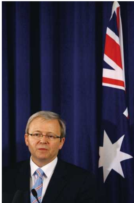
Kevin Rudd wants to ratify the Kyoto Protocol.