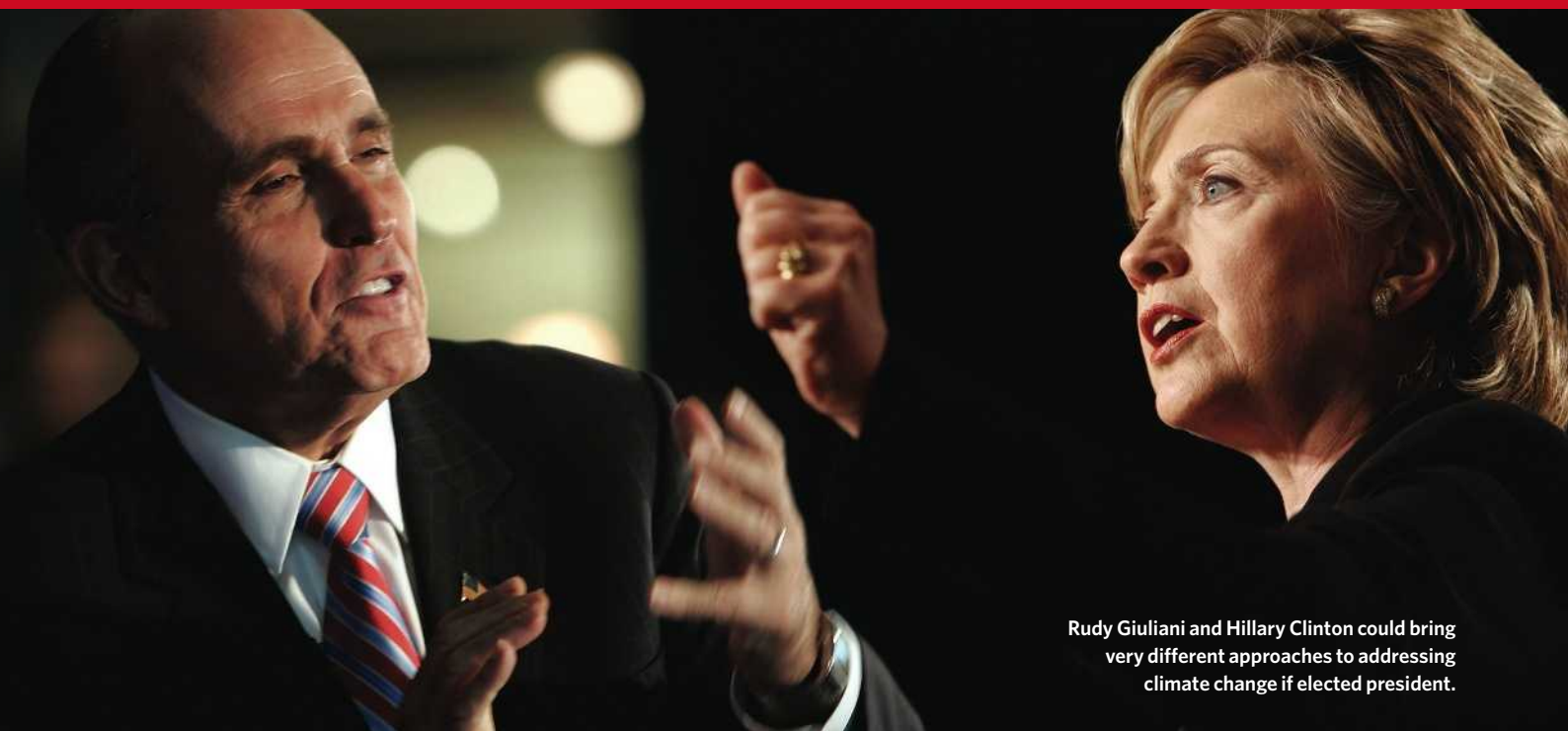
Rudy Giuliani and Hillary Clinton could bring very different approaches to addressing climate change if elected president.