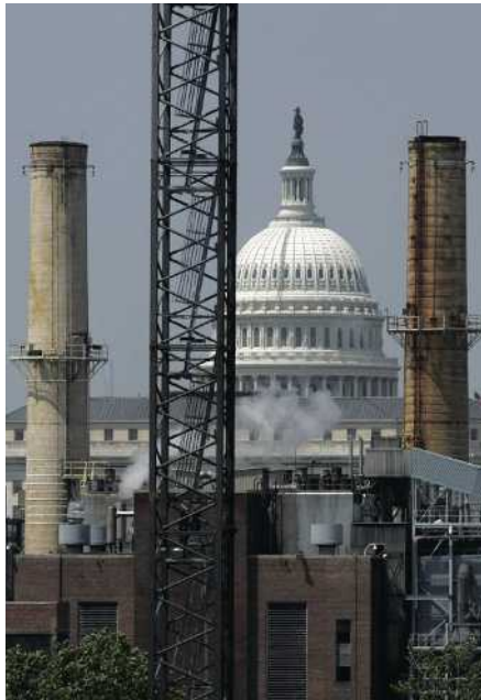
Power struggle: legislation to curb US emissions will need to strike a political compromise.