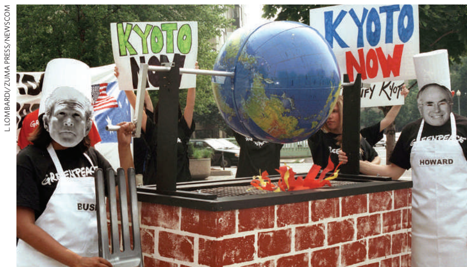
Climate villains? Protesters have called for the United States and Australia to ratify the Kyoto Protocol.