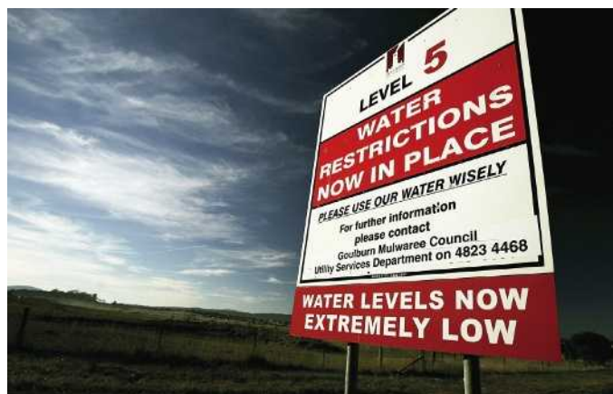
Water restrictions have brought the issue of climate change to the fore.

The Howard government has made several major, if criticized, initiatives in the field of climate. In 2005, Howard took Australia into the Asia-Pacific Partnership on Clean Development and Climate, a non-binding partnership established with China, India, Japan, South Korea and the United States to foster cooperation on climate-change action. Australia pledged Aus$100 million to the group over five years, from which it has so far allocated Aus$60 million to 44 projects. These include deployment of high-efficiency solar-power stations, improved