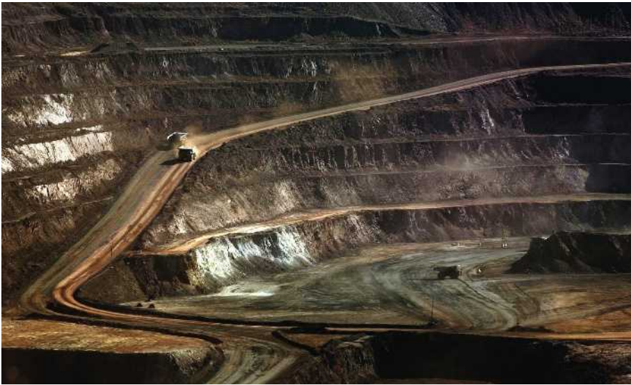
Australia's wealth of coal has made developing alternative energy sources a relatively low priority.

efficiency standards for appliances and a mobile system that can test carbon capture at coal-fired power stations.