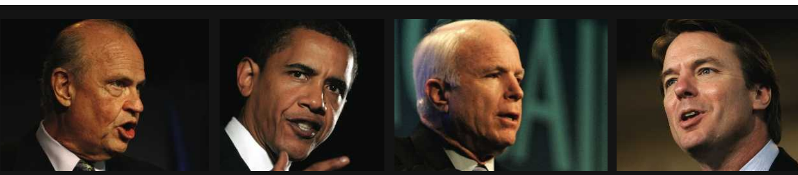
Charismatic candidates, but how green are their policies? From left to right: Fred Thompson, Barack Obama, John McCain and John Edwards.